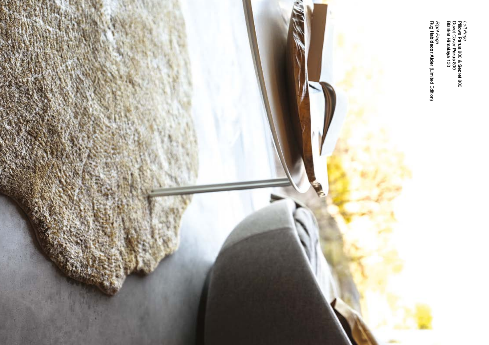
Left Page Pillows Paris 800 & Secret 800 Duvet Cover Paris 800 Blanket Himalaya 100 Right Page Rug Habidescor Alder (Limited Edition)