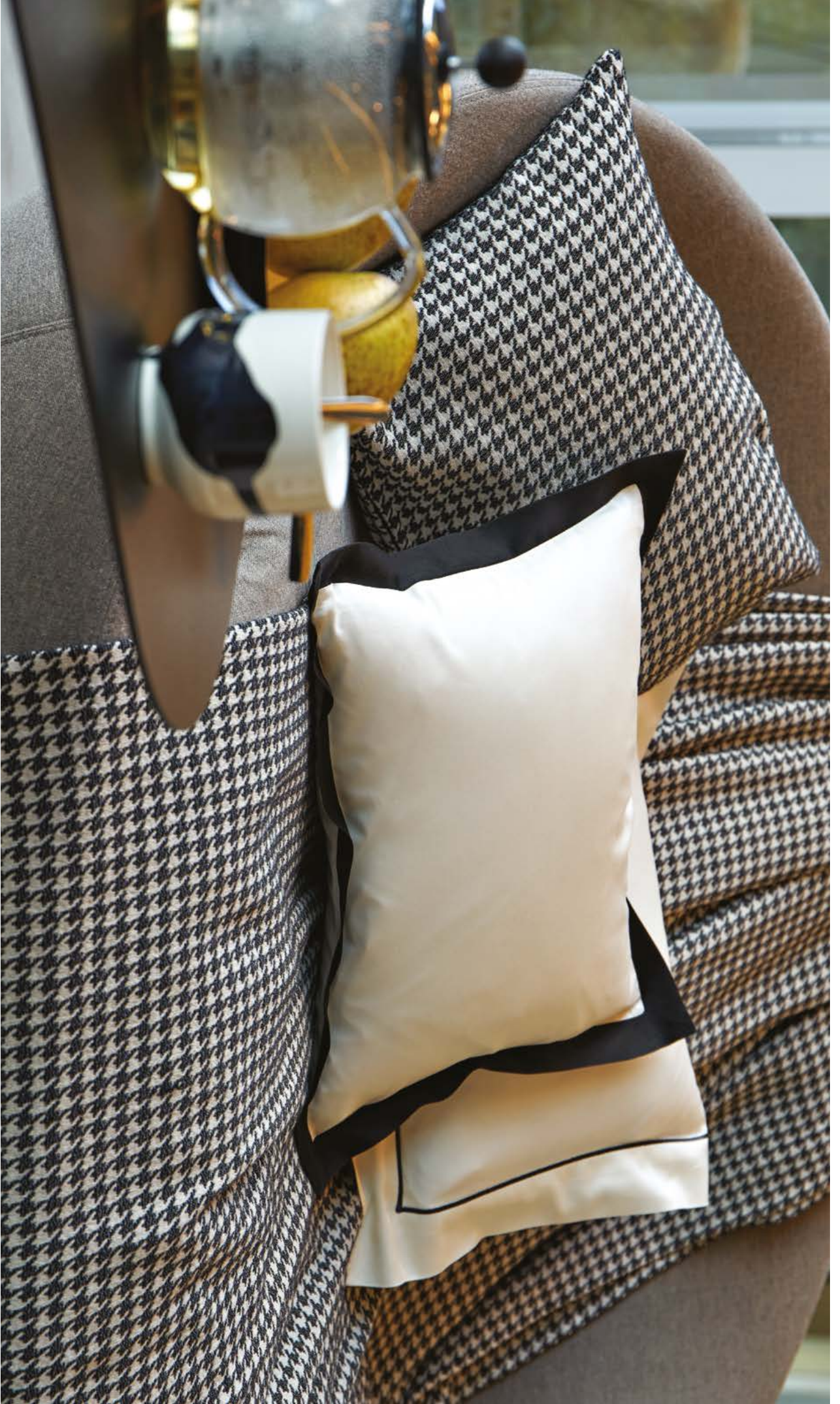
Pillows Bourdon 199, Sonho 101 & Lady 990 Throw Lady 990