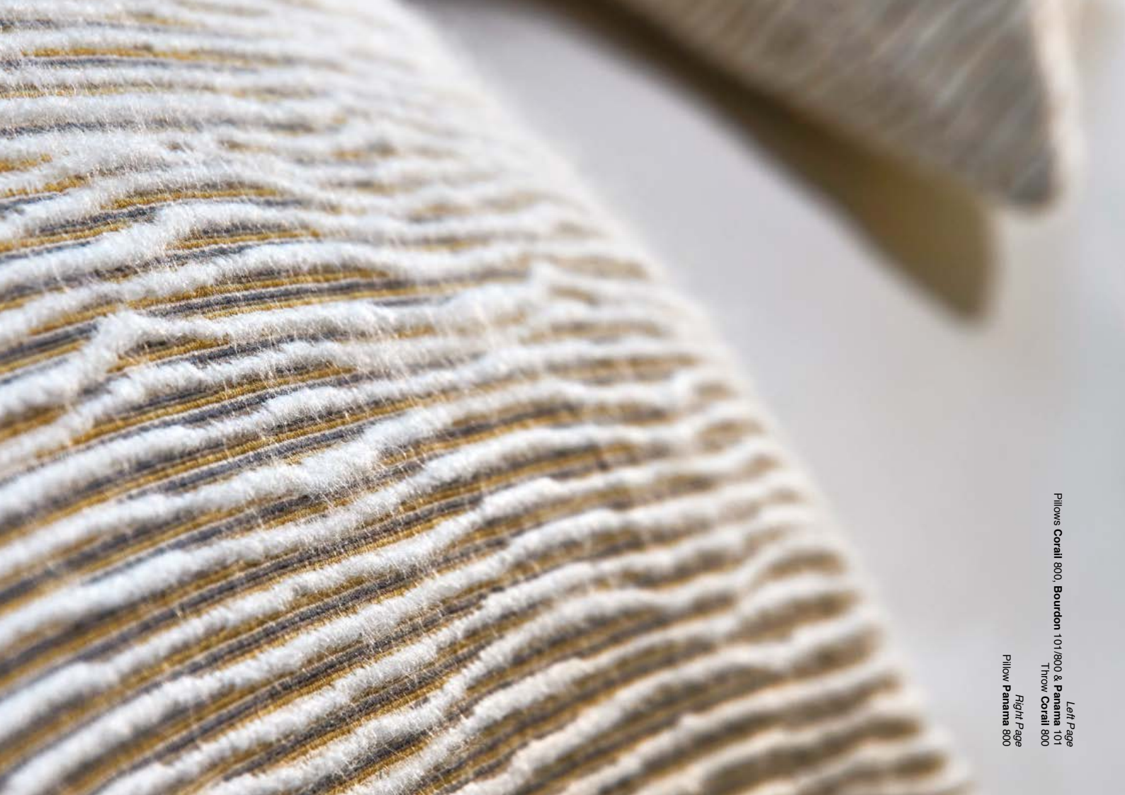
Left Page Pillows Corall 800, Bourdon 101/800 & Panama 101 Throw Corall 800