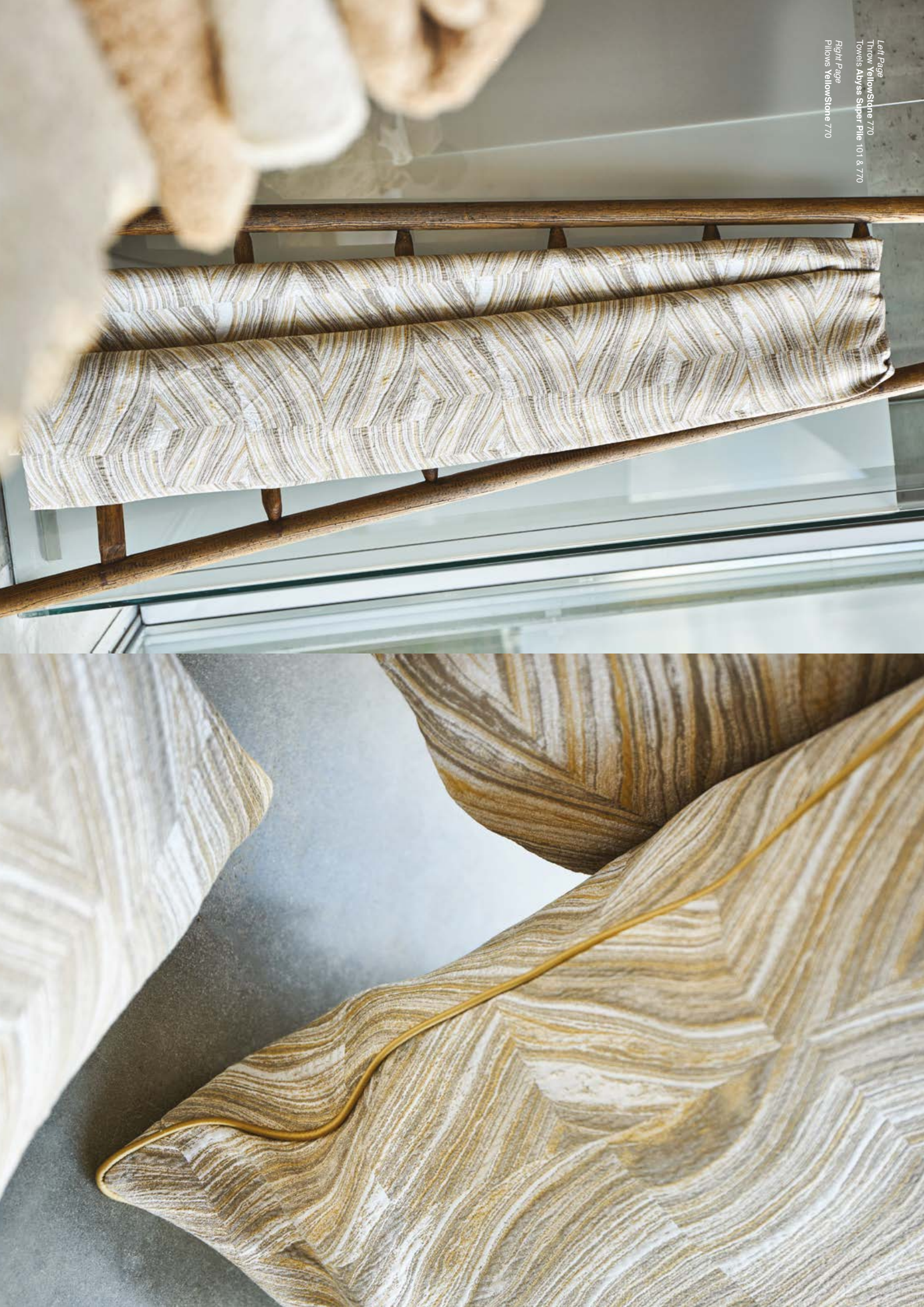
Left Page Throw YellowStone 770 Towels Abyss Super Pile 101 & 770 Right Page Pillows YellowStone 770