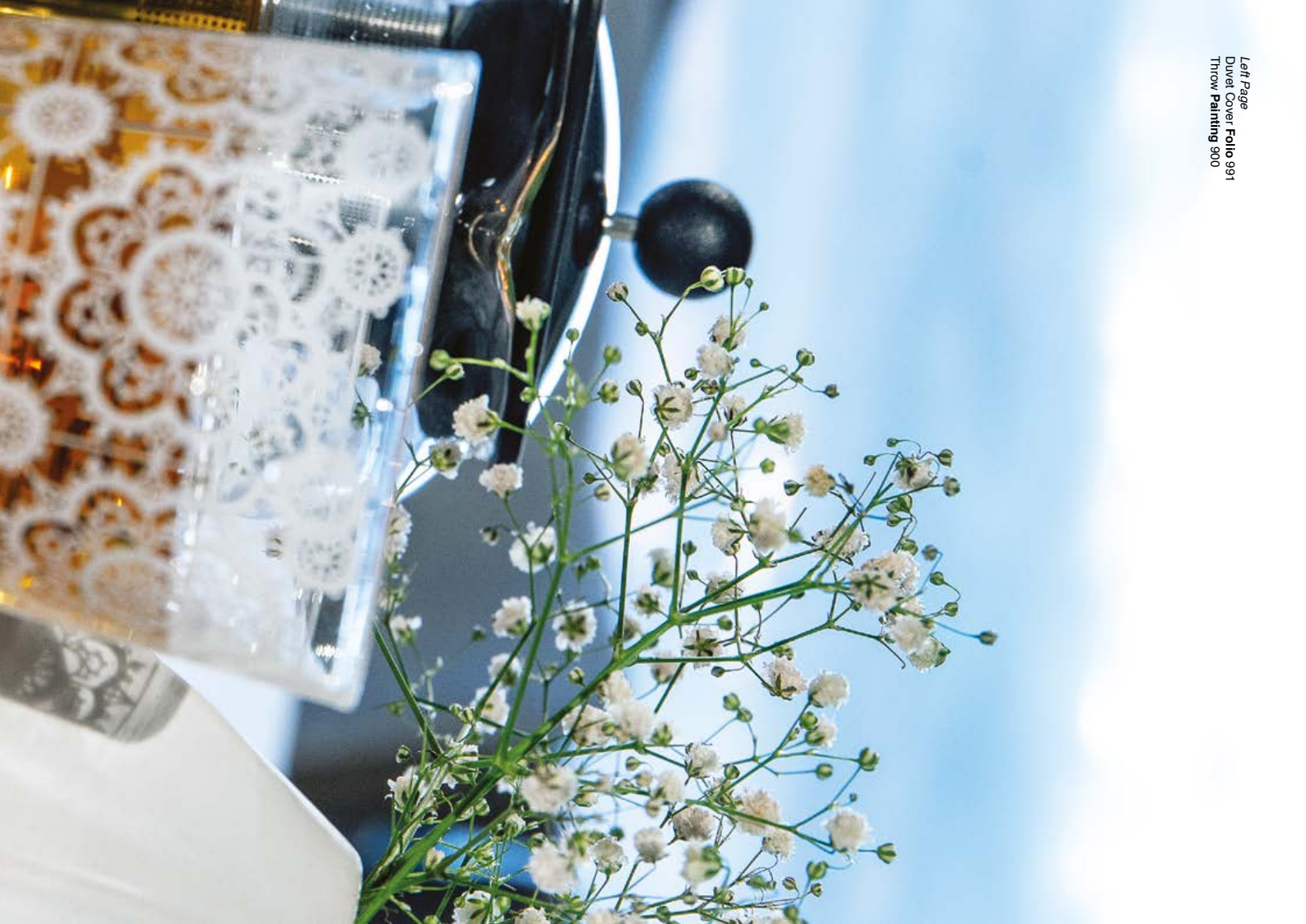
Left Page Duvet Cover Folio 991 Throw Painting 900