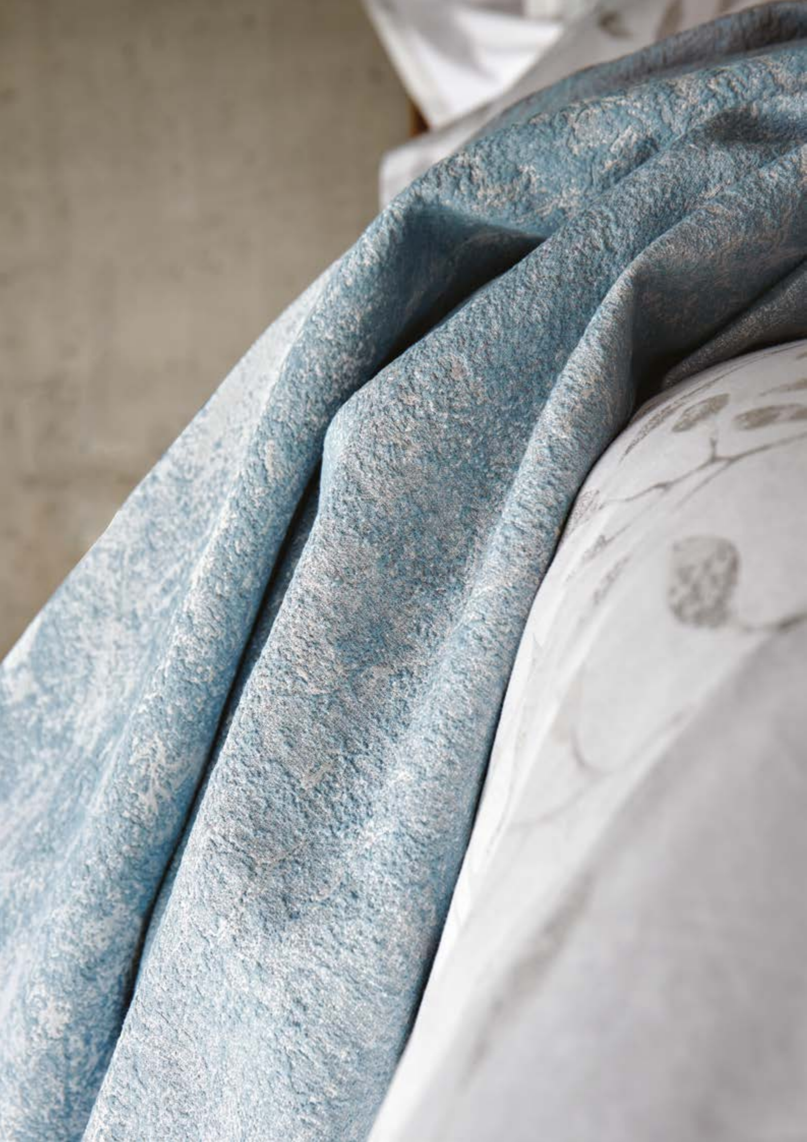
Left Page Duvet Cover Folio 991 Throw Painting 900