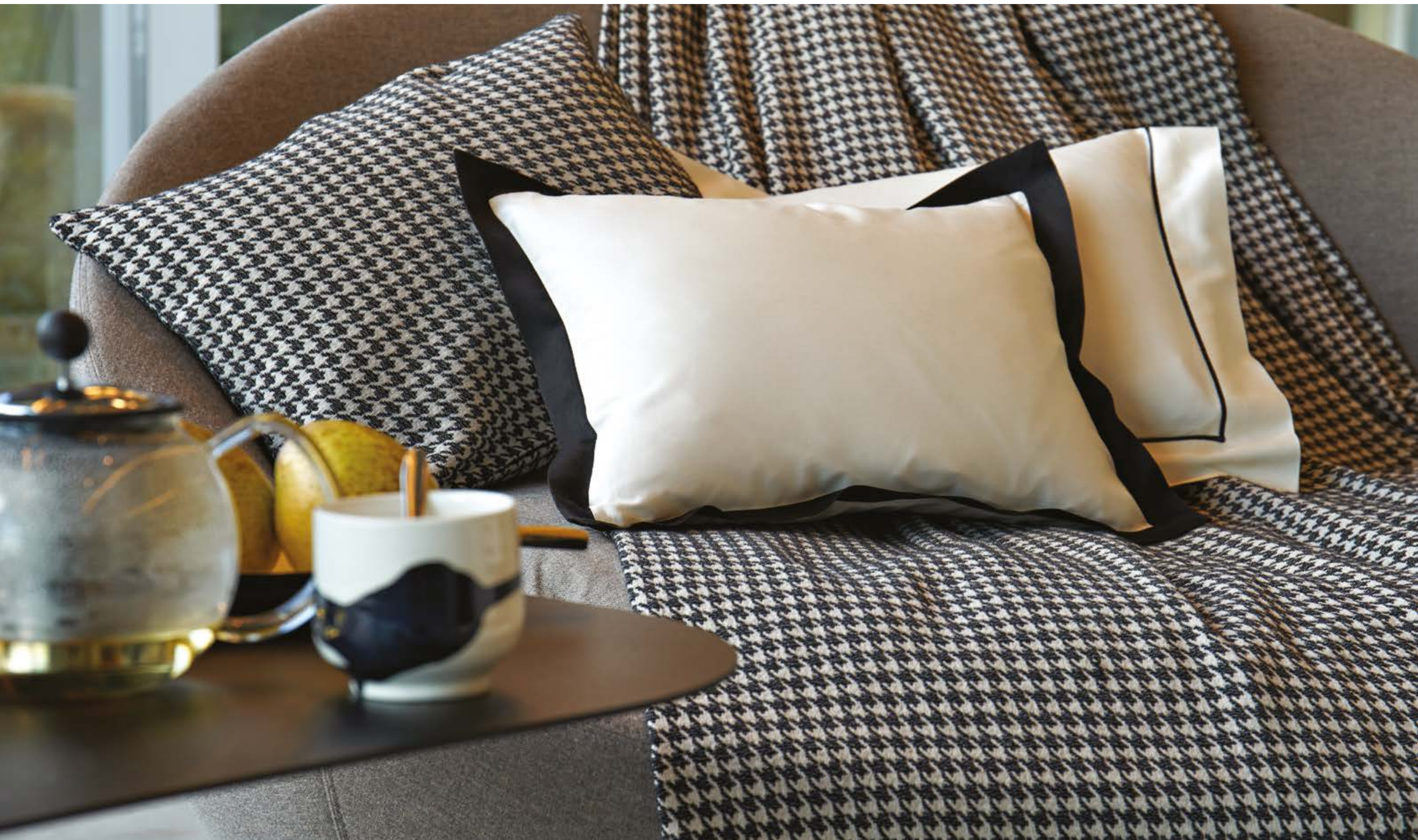
Pillows Bourdon 199, Sonho 101 & Lady 990 Throw Lady 990