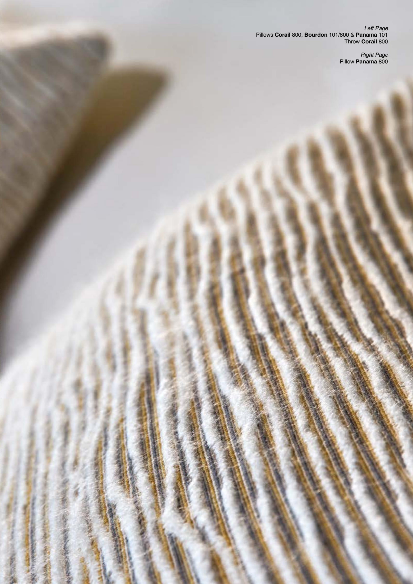
Right Page Pillow Panama 800