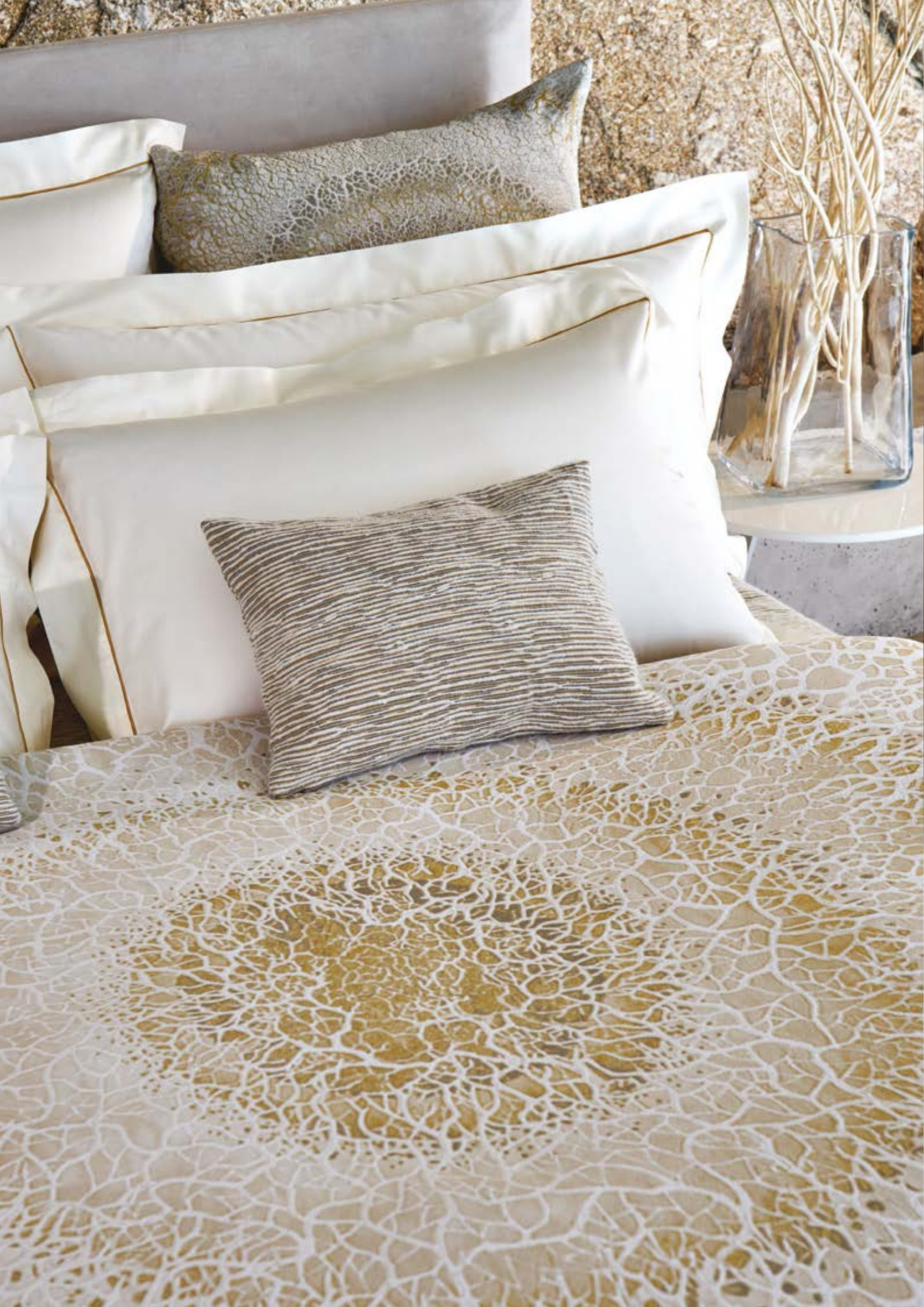
Left Page Pillows Corail 800 , Bourdon 101/800 & Panama 101 Throw Corail 800